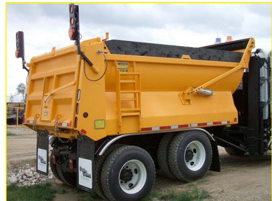
Right: Entire exterior box of sander (yellow & grey) is sprayed with LINE-X XS-100 .