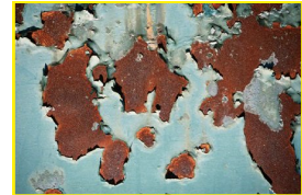
Above: powder coated metal. Below: Line-X protected metal.

The Result: With limited down time, and greatly reduced future maintenance, equipment is protected against the extreme effects of salt action, abrasion, humidity and weather changes - ready to take on whatever Old Man Winter can dish out.