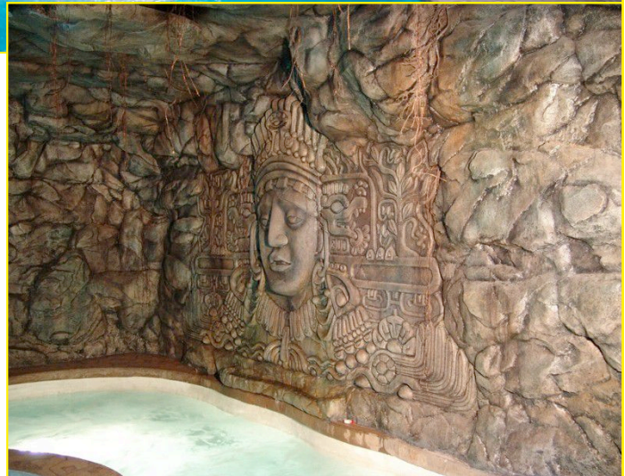
For more information on Studio Y Creations, visit www.studioycreations.com .

The waterfall hides the entrance into the hot tub room where all the surrounding walls are designed with an ancient Mayan theme. All walls, again constructed from EPS, are sprayed with grey LINE-X and custom painted.